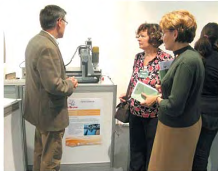
The evaluating jury has been very busy