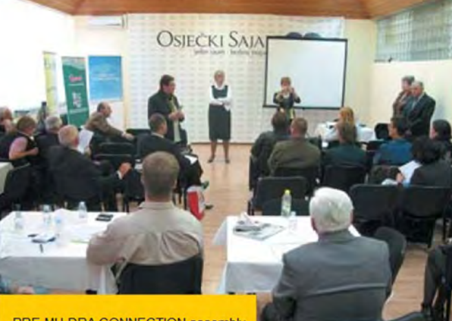
PRE-MU-DRA CONNECTION assembly of bilateral business talks where the Tera incubator tenants made numerous