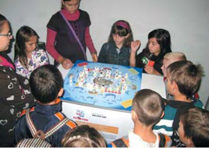
Bible games were a great hit among the youngest