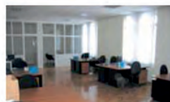
Pre-incubator before and after redecoration