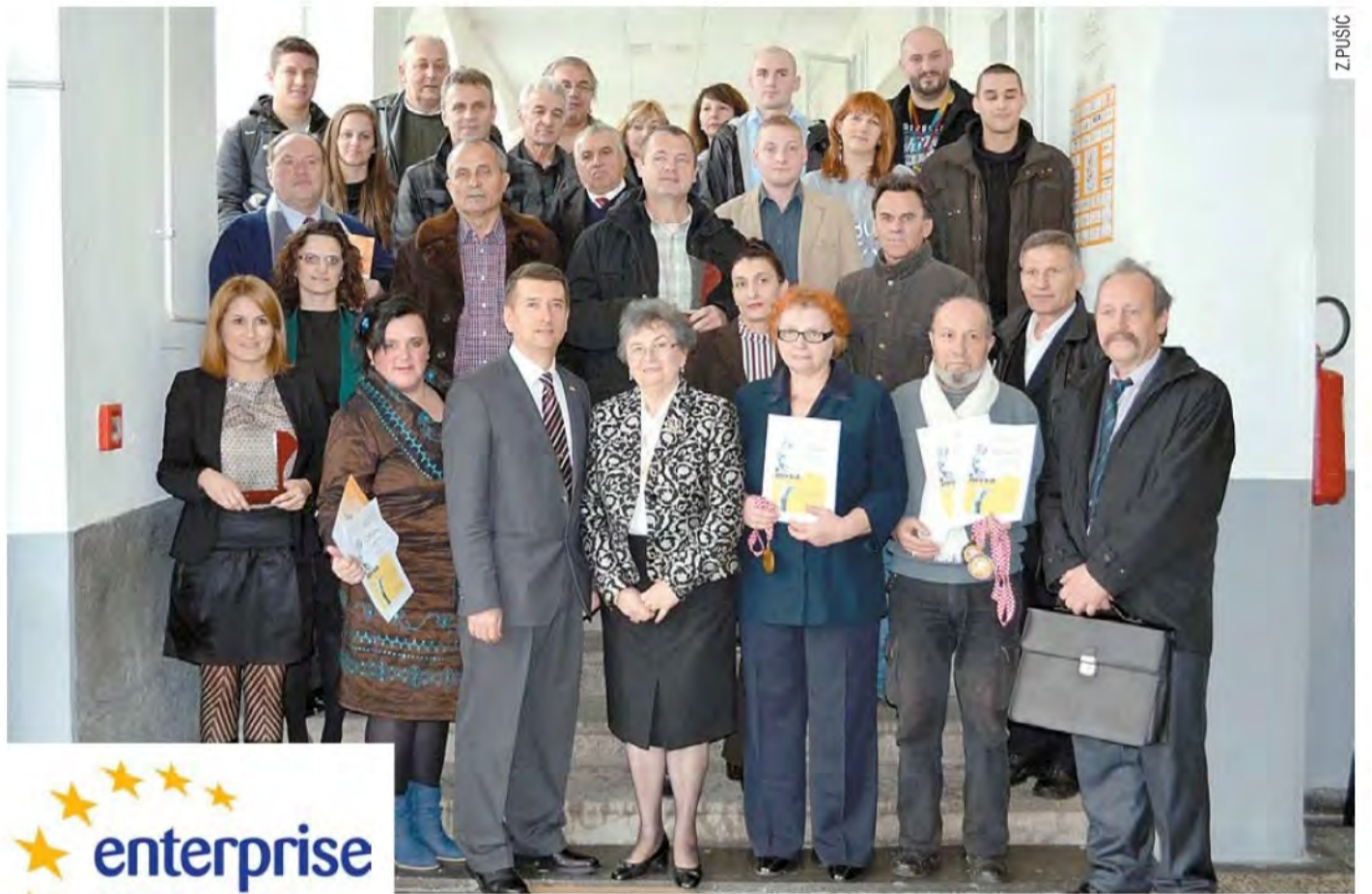
This year's competition finale took place in Šibenik from 8 to 10 November 2012.