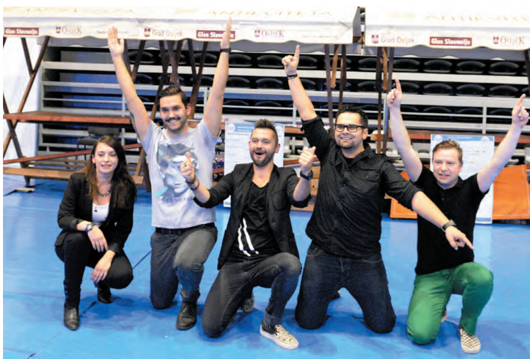
● The rock band Vatra celebrated its 15th birthday at the concert organized at the international exhibition Be the Role Model™ / Inova® 2014 in Osijek. The City Garden Arena and its guests had all the magic ingredients for a great concert on Friday night: excellent auditorium and technics, lots of fans of good music and Vatra, who gave the best of themselves.