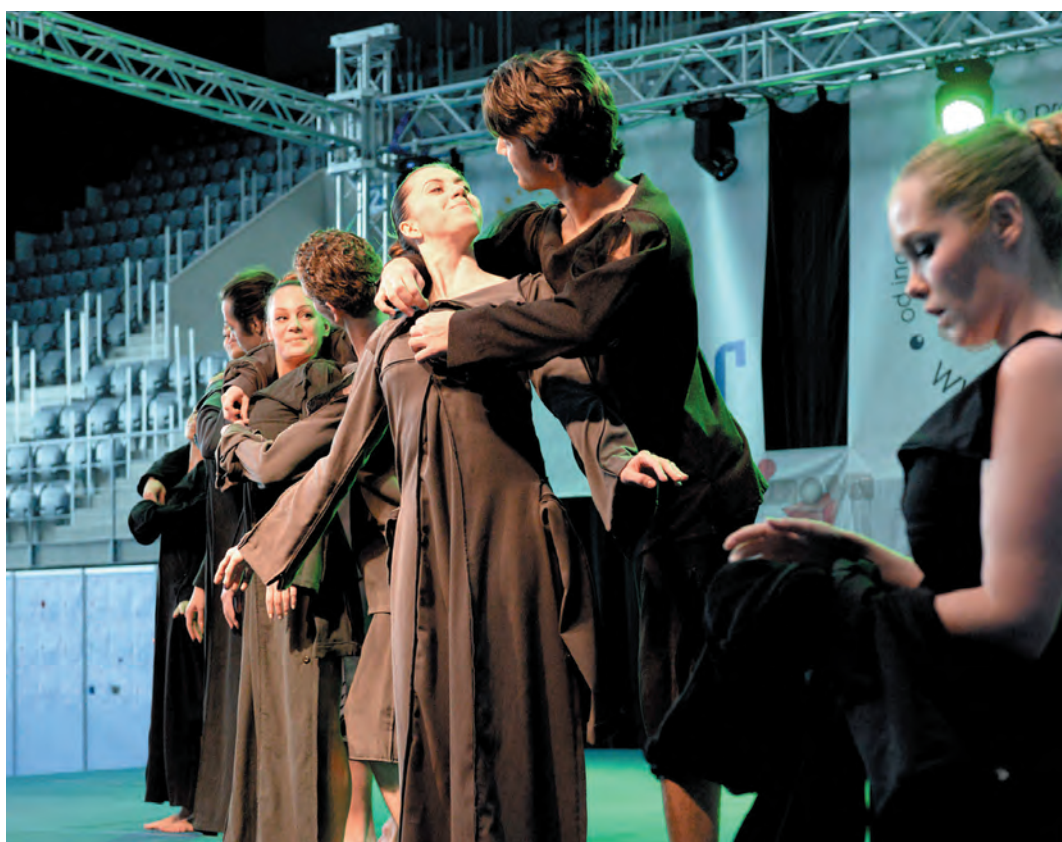
● The presentation "The neutral theatrical costumes" called UNZIP, was not only able to effectively demonstrate the application of the costume, but also showed the quality of the Academy of Arts in Osijek.