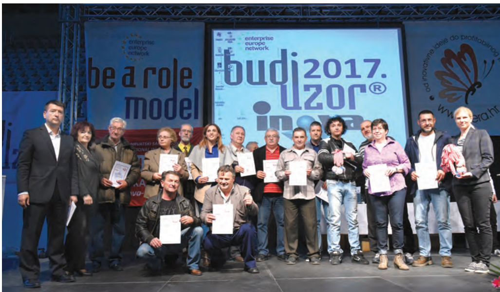
● Croatian Inventors - Entrepreneurs Association and TERA clients award winners