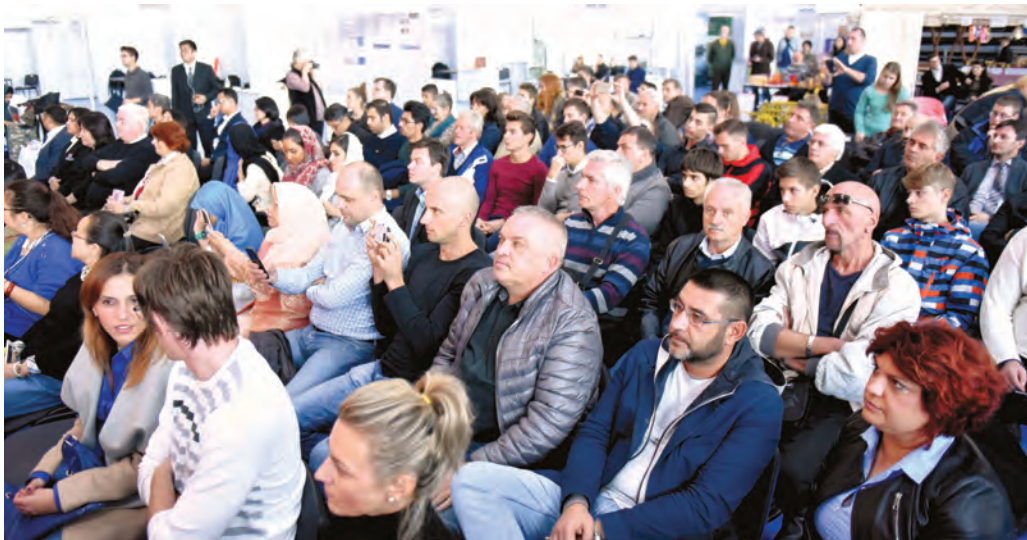
● The audience awaiting the Awards Ceremony