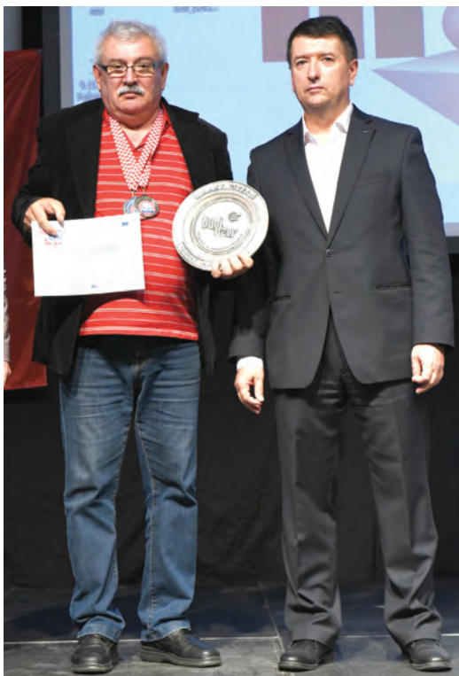
● Special award winners