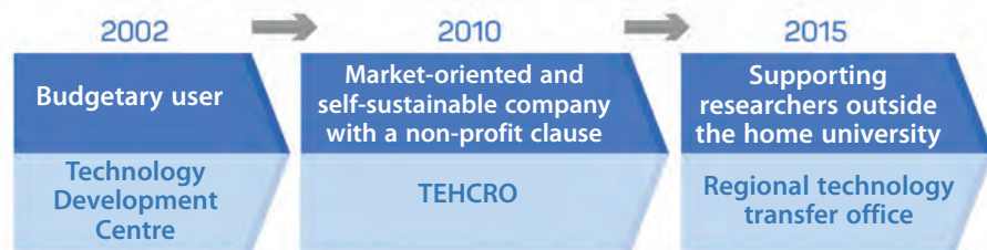
● The course of development of TERA Tehnopolis

BUSINESS CONSULTING INTELLECTUAL PROPERTY