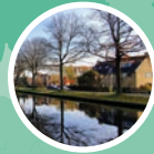
Gelderland Midden The Netherlands